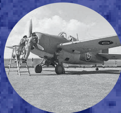
The US Grumman Martlet fighter used by the British Fleet Air Arm on the ground at Lee-on-Solent Fleet Air Arm Station.

The airfield of HMS Daedalus played a crucial role in 'Operation Overlord' which took place on the 6th June 1944. Some 435 sorties took off from Daedalus, making it the busiest single airfield on D-Day. In all, over 2,000 sorties were flown from here, the majority in the first ten days of operation.