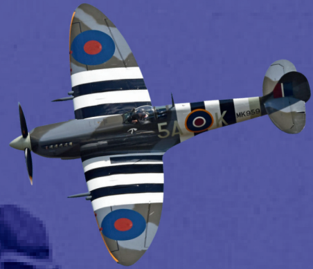
Photo - Pilots of Navy squadron VCS-7 with a Spitfire fighter during the Normandy invasion

For reference black and white 1944 pictures are taken from the following Wikimedia Commons Website and www.hampshireairfields.co.uk , which are in the public domain