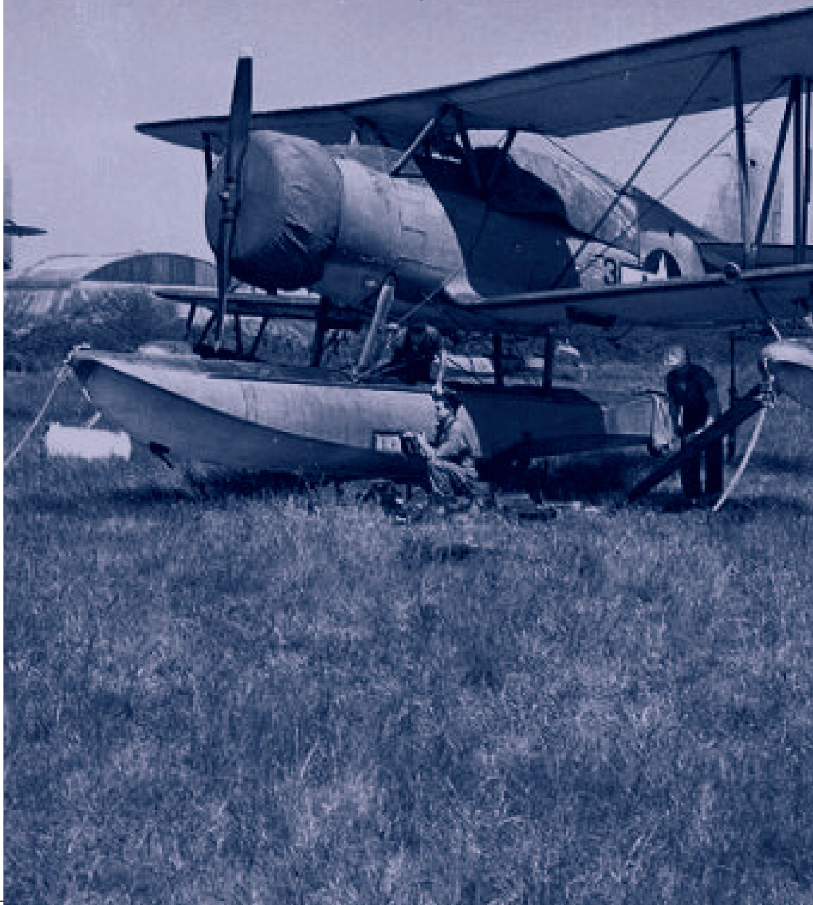
VA Curtiss SOC Seagull of US Navy VCS-7 at Lee-on-Solent circa June 1944. The Squadron's aircraft were temporarily out of use whilst the aircrew used Spitfires in support of the D-Day landings. Another SOC and a Vought OS2U Kingfisher are parked in the background.