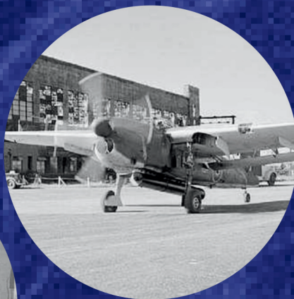
A loaded Fairey Barracuda torpedo bomber taxi-ing past an aircraft shed on the way to the runway at RNAS Lee-on-Solent