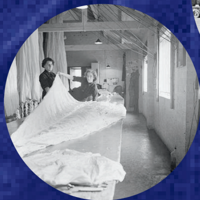
Members of the Women's Royal Naval Service working in the Fleet Air Arm's parachute packing room at RNAS Lee-on-Solent.